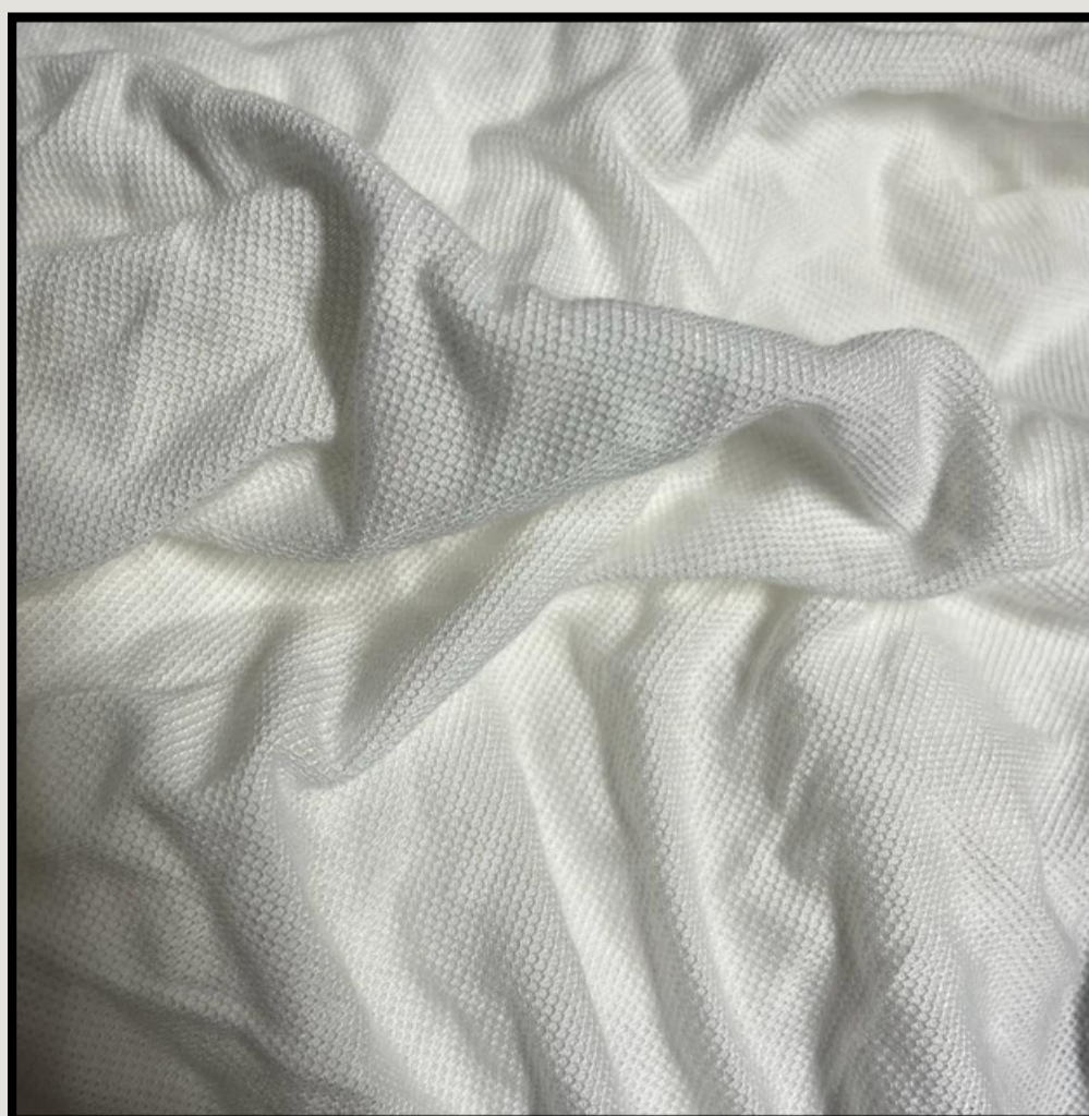
170 GSM , 60" OPEN WIDTH CIRCULAR KNITS PIQUE FABRIC