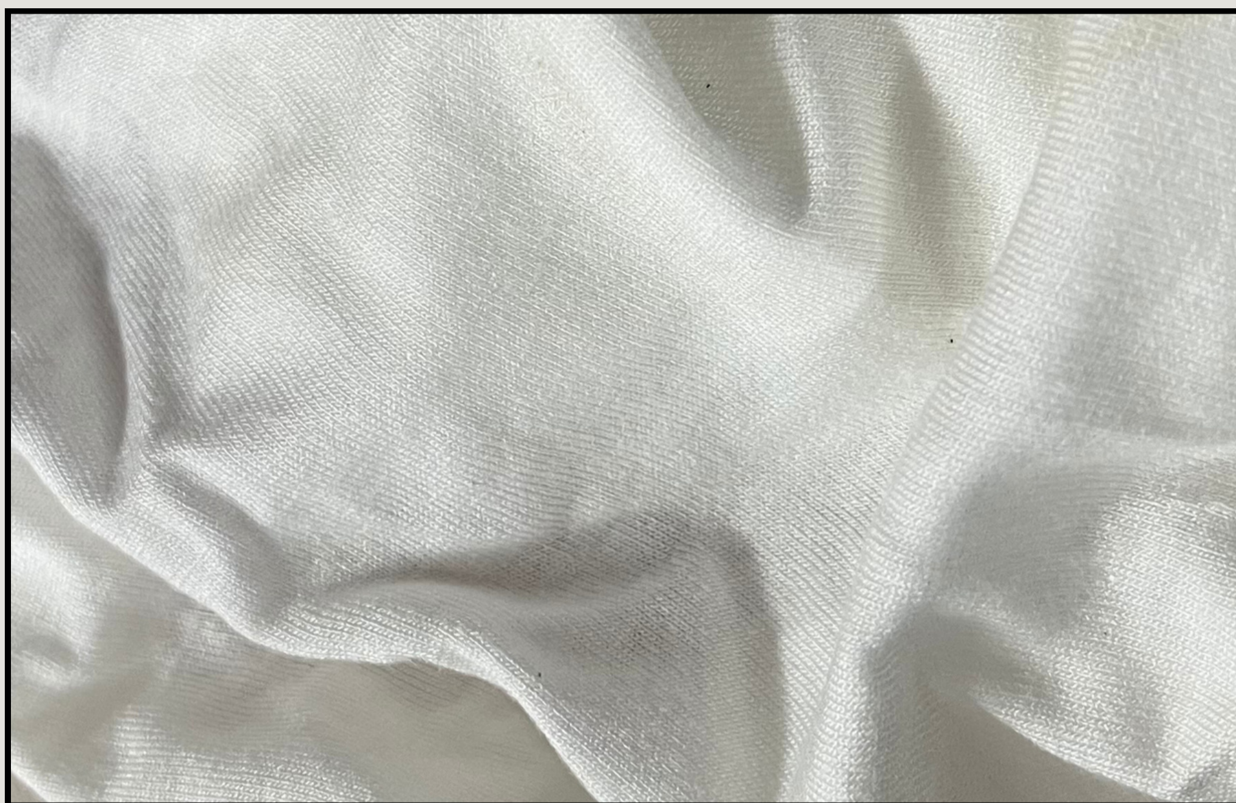
180 GSM , 60" OPEN WIDTH CIRCULAR KNITS FABRIC