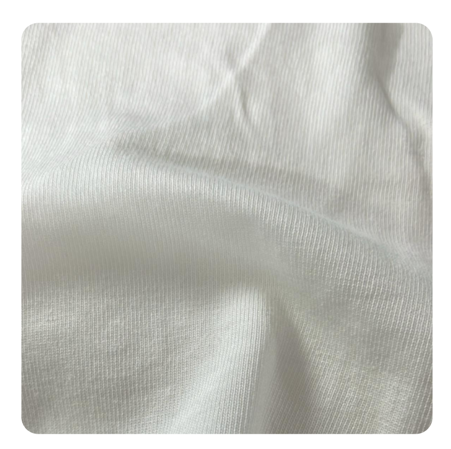
BACKING THE PVL

plant cellulose fabric technology converts plant waste cellulose into eco-friendly textiles. Extracted plant fibers are processed into cellulose followed by spinning and fabric making.